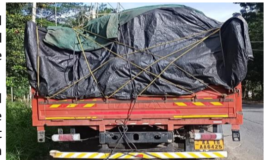
Contribution of Abhaya foundation