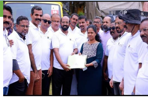
FUMMA Members Deliver Essential Furniture to the District Collector