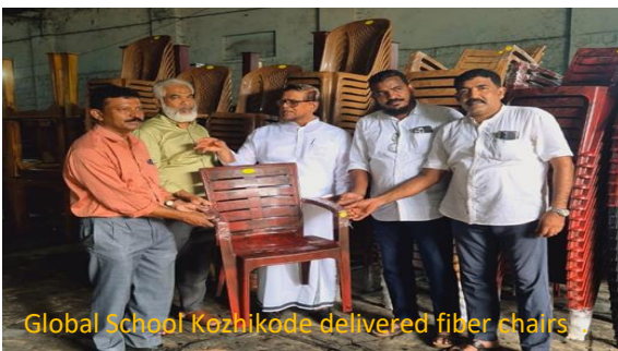
Global School Kozhikode delivered fiber chairs