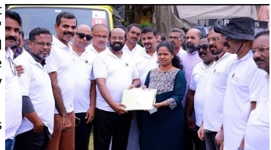
FUMMA Members Delivered Essential Furniture to the District Collector