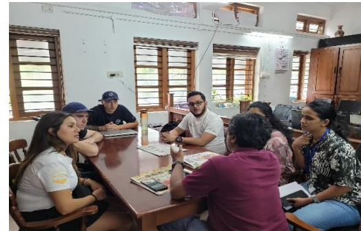
Discussion with HELP.NGO members and member-secretary, KSDMA