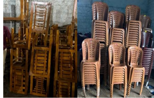
Items Delivered BY RishiFIBC solutions pvt ltd