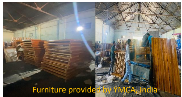
Furniture provided by YMCA, India