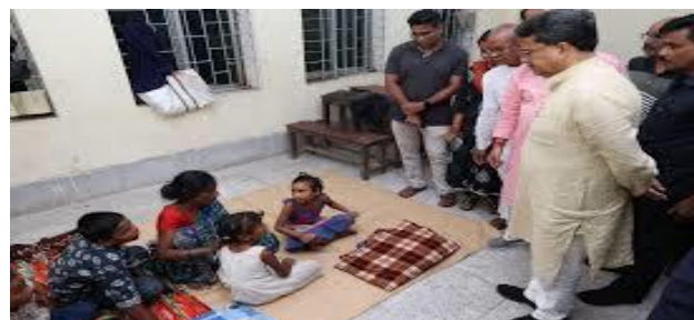
Tripura Flood Situation