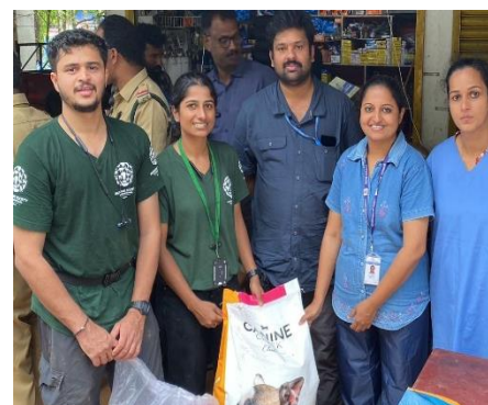
Animal rescue and feed provision in landslide areas by HSI.