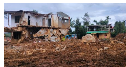
Landslide affected area : Chooralmala