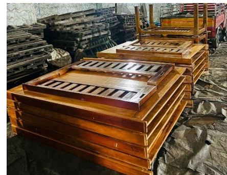
Nirman Foundation is providing support for cots for the rented houses.