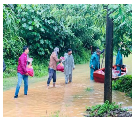
Pulse Emergency Team Providing Food items in Flood affected area