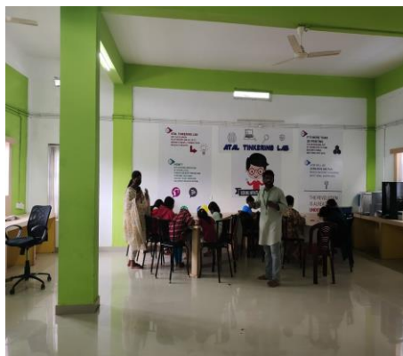
ESAF Conducting Child oriented activities for affected children