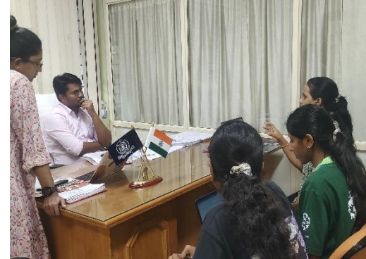
Discussion with the Sub-Collector regarding the "Back to Home" kit.