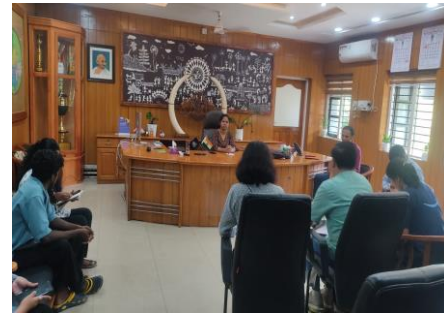
Sphere India and Amazon met with the District Collector to discuss future coordination.