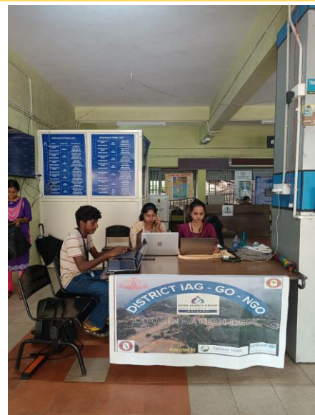
GO- NGO Coordination Desk, SEOC

A core committee was formed to oversee the operations of the Coordination Desk, consisting of two members from Sphere India (the technical team coordinating the GO-NGO initiative), along with representatives from UNICEF India, Wayanad IAG, and DDMA. With the approval of the DM Commissioner and the District Collector, the Wayanad IAG GO-NGO Coordination Desk was officially established at the collectorate on August 2 nd . The desk was created to streamline and enhance the coordination between government agencies and non-governmental organizations (NGOs), with the primary goal of ensuring effective collaboration and communication among all stakeholders. This unified approach was designed to enable a more efficient and organized response to the challenges faced by the affected communities in Wayanad.