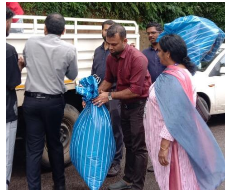
Sthree Shabdham :waste cleaning in the landslide area.