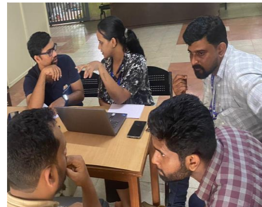
Meeting with Vendors and donors on 15-08-2024