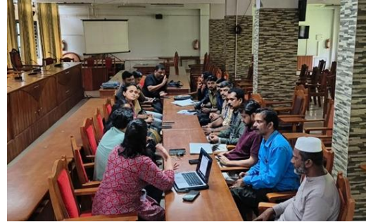
IAG Wayanad boosts NGO coordination and community-focused action plans.