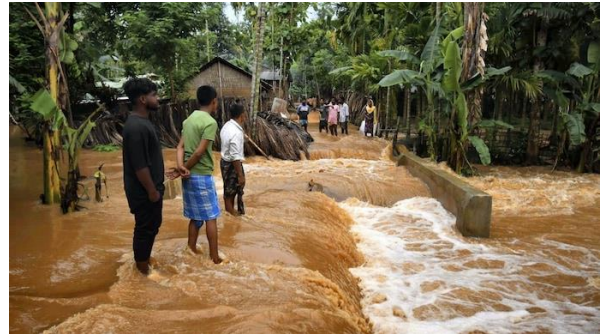
Damaged road in Nagaon district of Assam