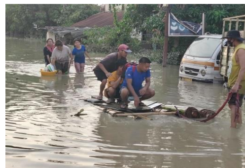
Flood waters in Lairikyengbam Leikai village, Imphal East district, on June 1.