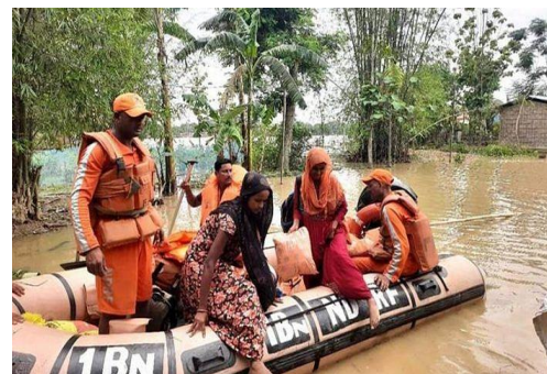
Flood rescue operations in Assam's Hojai district