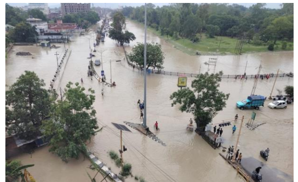
Khoyathong LIC traffic point in Imphal on June 1