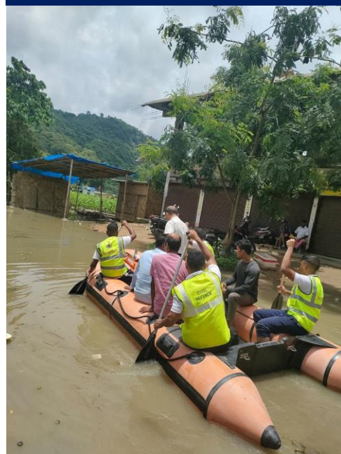
Flood rescue in Assam