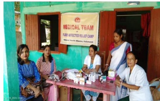
Health checkup by National Health mission Hailakandi