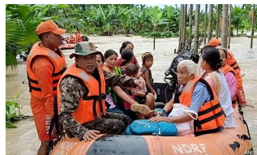
Flood Rescue in Assam