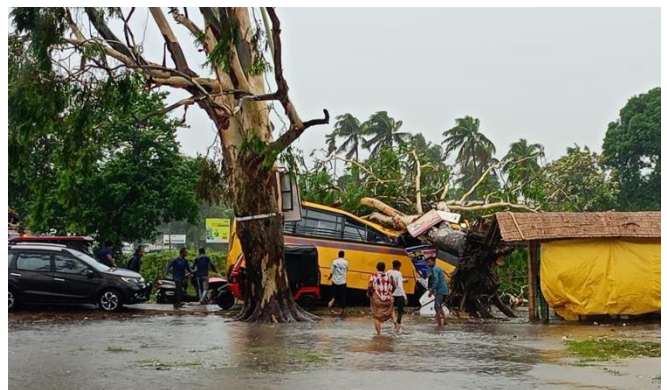
Tree fell on a school bus in Sonitpur, Assam