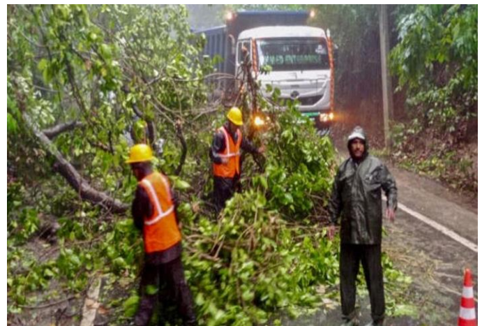
NDRF clearing the roads and power restoration work in West Bengal