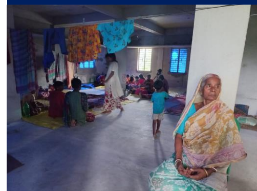
Gobordhanpur Flood Centre, Pathapatima, Source: IAG Group