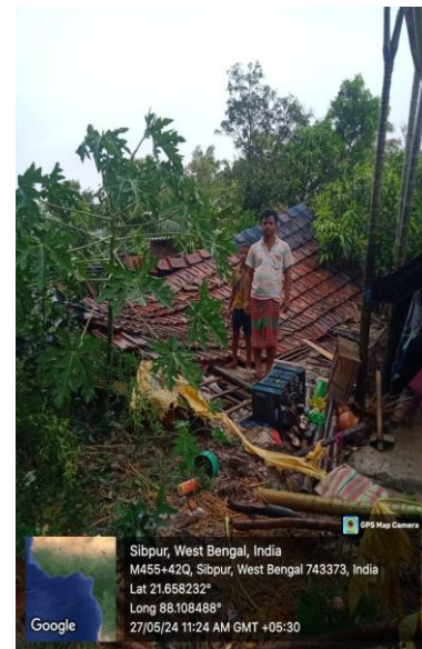
Sibpur, West Bengal, India M455+42Q, Sibpur, West Bengal 743373, India Lat 21.658232° Long 88.108488° 27/05/24 11:24 AM GMT +05:30