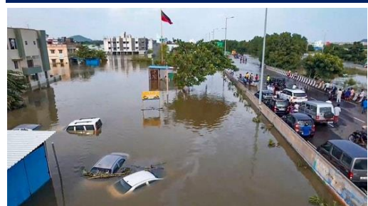
Areal survey of flood hit areas : TN