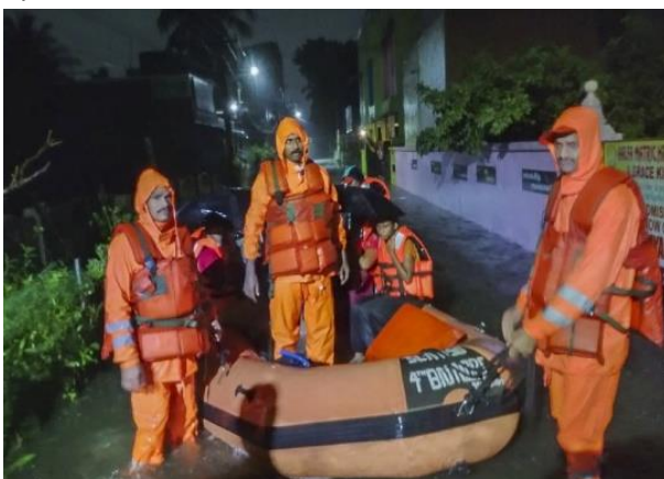
NDRF personnel evacuate residents from a flooded area