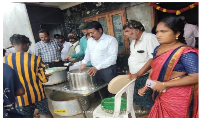
Zonnawada relief camp Buchireddypalam mandal, Nellore district