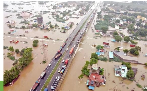
Aerial picture of flood hit areas : TN