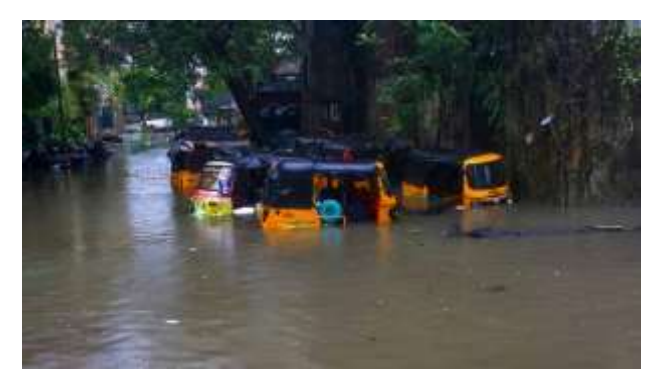
FIGURE 2: WATER LOGGING IN ANDHRA PRADESH

The cyclone's impact became evident on the night of December 3 and December 4 when heavy rains hit the coast of Tamil Nadu, leading to extensive flooding in various areas of Chennai. The cyclonic storm made landfall in the afternoon on December 5 in Bapatla between Nellore and Machilipatnam in Andhra Pradesh. It had earlier impacted Chennai and the adjacent areas of Tamil Nadu with maximum force on December 4. Heavy rainfall in northern districts of Tamil Nadu, including Chennai, caused road inundation and disruptions in daily life. Chennai reported 17 casualties due to rain-related incidents, prompting the closure of the airport on December 4 after a submerged runway. Operations resumed at 9 am on December 5. Regrettably, seventeen lives were lost in diverse rain-related incidents in and around Chennai, necessitating active rescue efforts by personnel utilizing fishing boats and farm tractors.