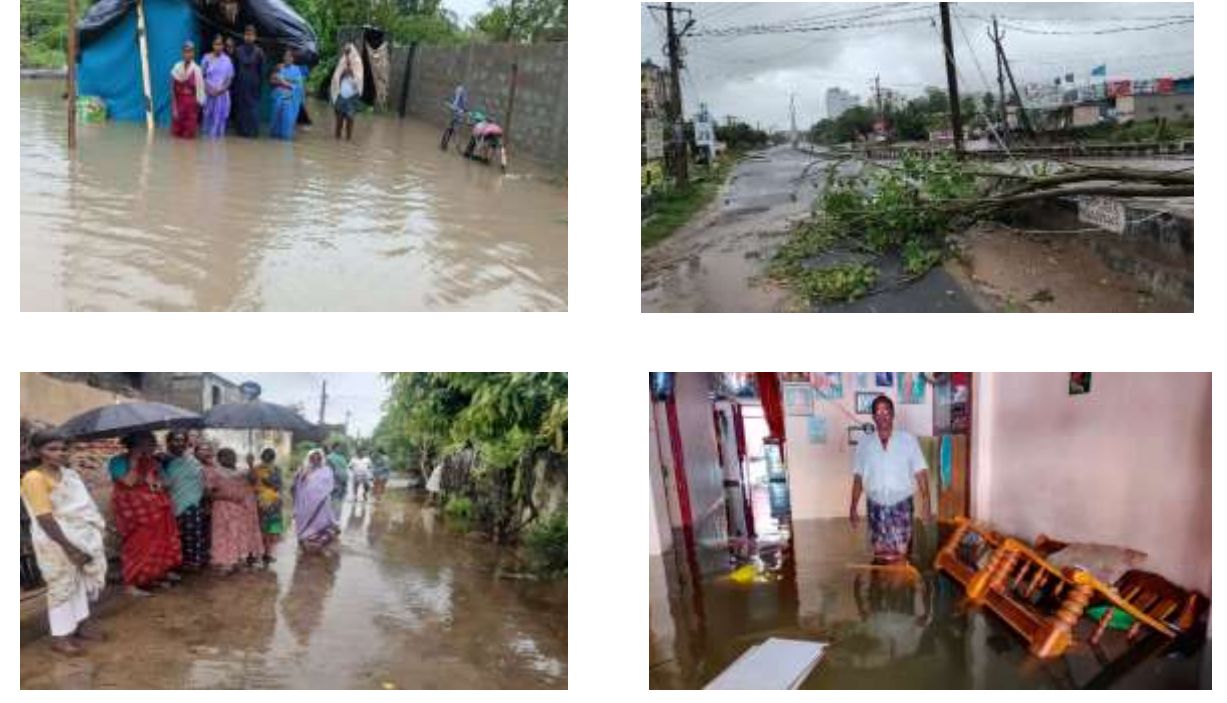
FIGURE 5: SITUATION IN CYCLONE AFFECTED AREAS