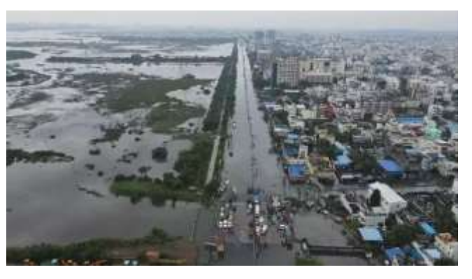
FIGURE 1: AREAL VIEW OF WATERLOGGING IN CHENNAI

The development of Cyclone Michaung, the fifth cyclone to manifest in the Indian Ocean this year and the fourth to originate in the Bay of Bengal, has precipitated a series of impactful events in the southern regions of India. The India Meteorological Department initially forecasted the development of Cyclone Michaung in the Southwest Bay of Bengal on Sunday, December 3, with a projected landfall along the coast of Andhra Pradesh by December 5.