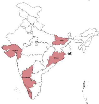
Flood Affected States and UTs

Crop area affected - Karnataka (168763HA), Odisha(2239HA)