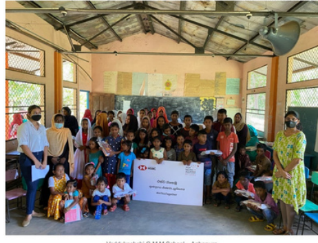
Vaddukachchi G.M.M School – Agbopura