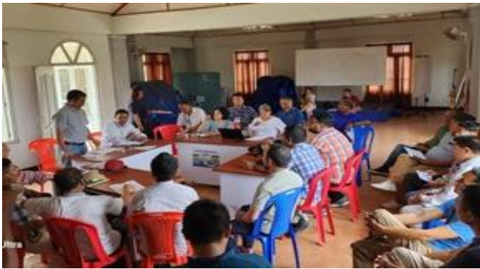
GO-NGO Coordination Meeting with district commissioners