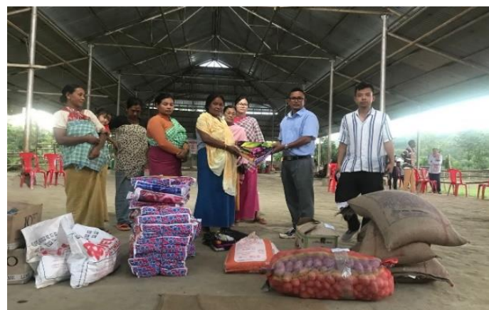
Providing Relief materials in the camps by HAI