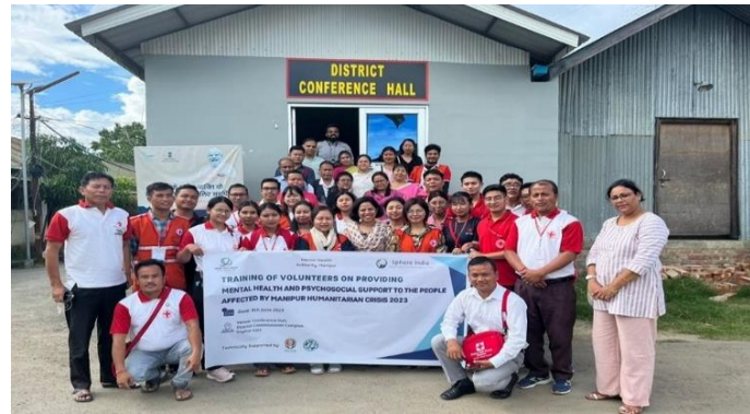
District Level MHPSS Training for volunteers