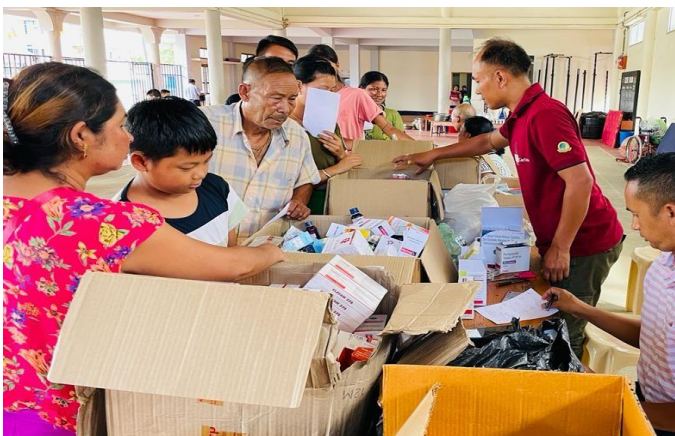
Health Check up Camps by Caritas India