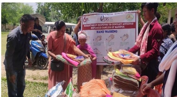
Humanitarian agencies providing Relief materials