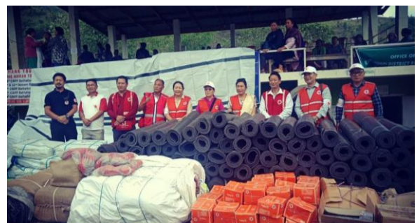
Humanitarian agencies providing Relief materials