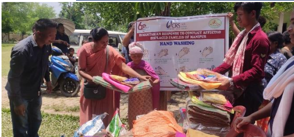
Humanitarian agencies providing Relief materials