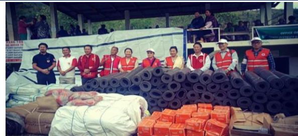
Humanitarian agencies providing Relief materials