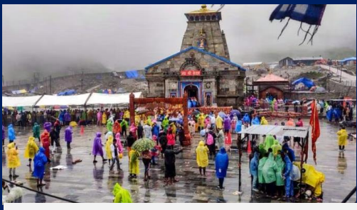
The Kedarnath Yatra in Uttarakhand was halted due to heavy rainfall on 12 July, resumed for a brief period on July 16.