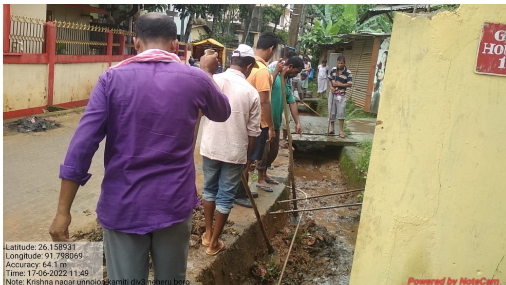
GMC employees engaged in drainage clearance