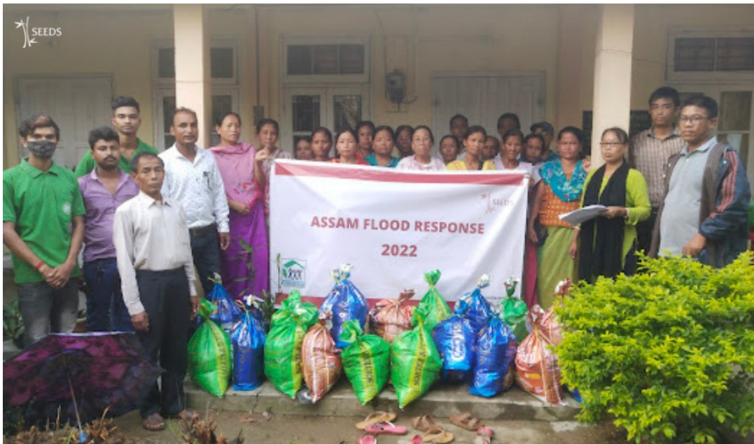
Relief distribution for flood affected population.