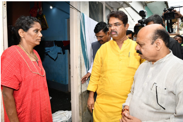
CM visiting affected population in Bengaluru