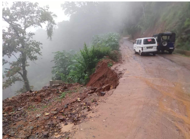
Damaged roads in Kodagu.