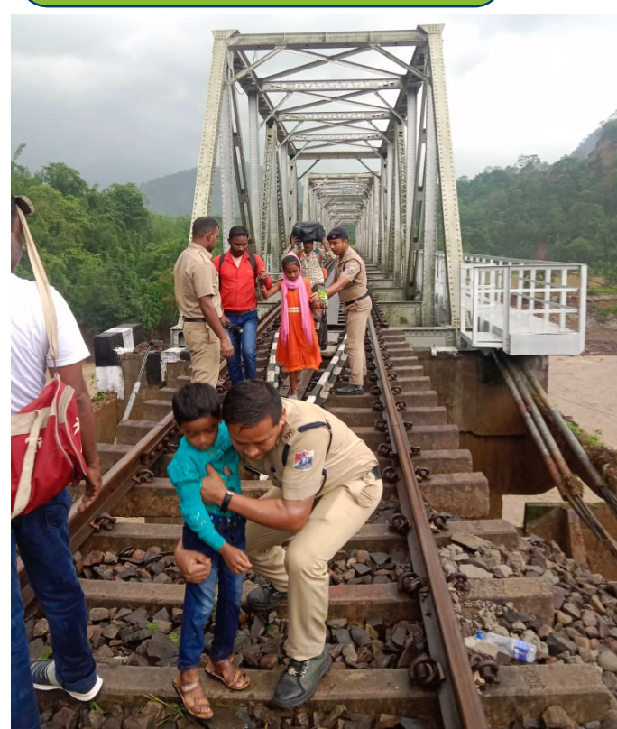
NF Railway evacuating stranded passengers at Ditokcherra