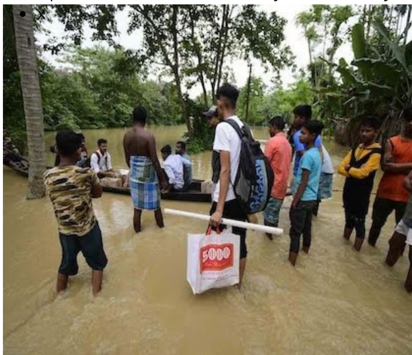
Flood situation in Assam