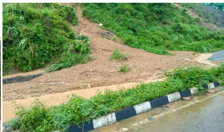
Roads blocked due to landslide