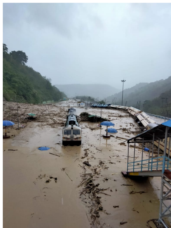
New Halflong Railway Station Dima Hasao, Source: The Hindu