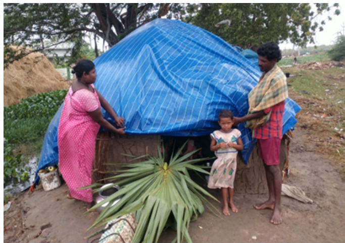
Affected households in Krishna