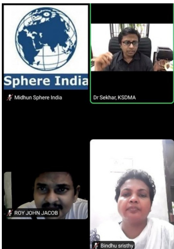
Kerala IAG Meeting on Heat stress and precautions