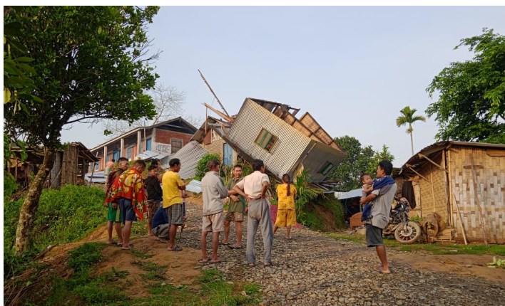
Houses blown away in Manipur