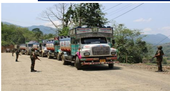
Assam Rifles providing security cover to trucks