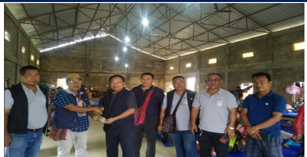
CYMA visiting relief camps