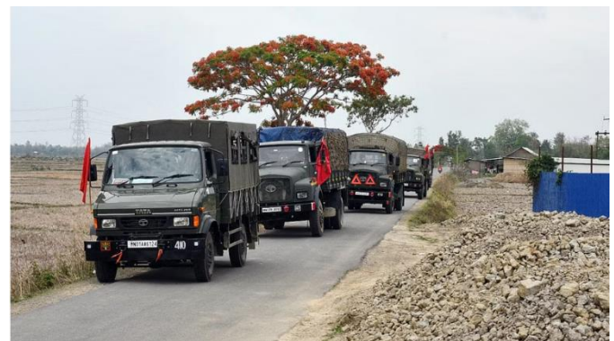
Manipur, May 05: Army and Assam Rifles personnel conduct a flag march in an area following violence that broke out in the Torbung area of Churachandpur after the Meiteis, who dominate the Imphal Valley demanded Scheduled Tribe (ST) status.