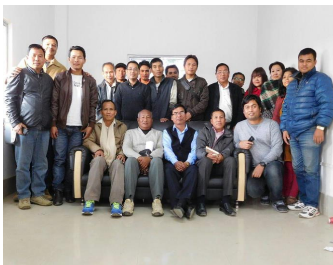
Trained JRNA Team at Disaster Management Institute, Imphal- Manipur

Facilitation and orientation on the JRNA tools and Kobocollect application for agencies planning for JRNA was conducted at Disaster Management Institute (DMI), Imphal on 6 th Feb, 2016 in coordination with Secretary, Relief & Disaster Management Department Government of Manipur which was also participate by civil defence and State Disaster Response Force (SDRF), Inter-Agency Group - Manipur with active technical support from Sphere India