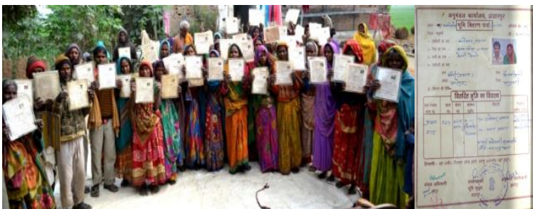
Beneficiaries with Land Documents

The DRR Projects of EFICOR in Bihar facilitated various interface meetings with the state government to avail 11 Khata land for 66 landless farmers of Mahadalit (Mushahar) communities in targeted villages called Bella Tal, Piprakotti Block, Motihari district and Khairi Mushari