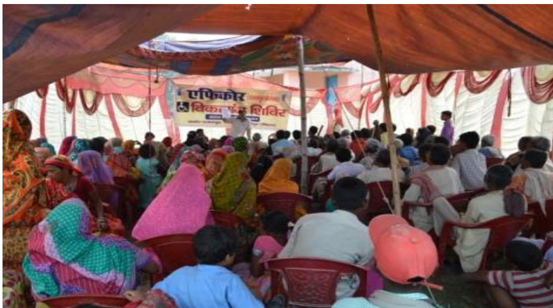
Sensitization on RTI & Disable Certificates for PWDs

As part of DRR and capacity building of vulnerable group EFICOR Hasanpur DRR Project in Samastipur district, Bihar organized a disability camp where 84 disabled people from 15 villages of Aura and Devra panchayats were imparted the disaster coping skills. The local Panchayat along with Disaster Management Committees took initiative to file application for disability certificates and other entitlements meant for the community. During this camp 54 out of 84 PWDs with more than 50% disability were identified, facilitated to avail the disability certificates and help was rendered to process the applications for disabled pensions.