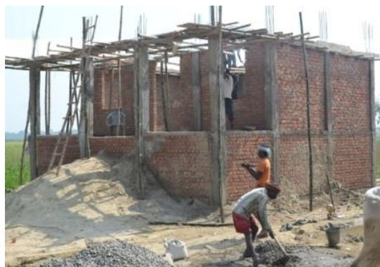
Flood Shelter Construction under progress

EFICOR began the construction of flood shelter in the month of February in Khairi Mushari village, Medhepur block, which would be beneficial for 150 vulnerable families to have shelter during flood situation as there is no other community building in this village. Due to the past flood experiences and frequent disasters faced by the community, the DMC (Disaster Management Committee) gave priority to donate the land for flood shelter which would entirely reduce their migration and displacement during emergency flood situation.