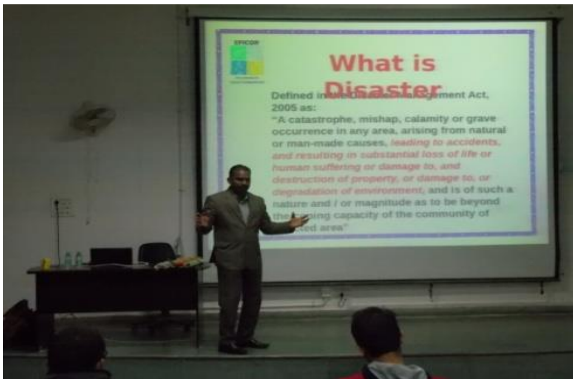
Disaster Management Training

engagement programme which awakened the young minds through practical knowledge and awareness on Emergency Response and Disaster Risk Reduction. During this thematic parallel workshop 50 students actively participated and had a better conceptual clarity regarding disasters and mitigation measures and they committed themselves for voluntary service and contribution towards humanitarian responses in future disasters.