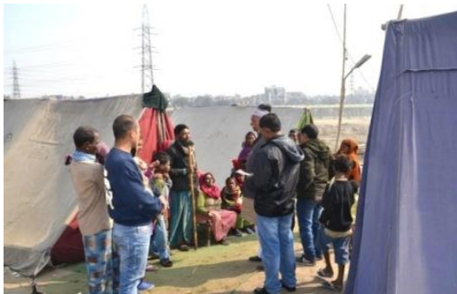
Need Assessment done by the Team

A massive fire broke out in a slum cluster of New Usmapur village, East Delhi - at 11:30 pm, on 9 th January 2016 and gutted the dwellings of over 14 rag picker-families. Three children, including a six-month old boy from a single family were killed; five others were severely injured as several huts burned down during this cold night. EFICOR has done initial needs assessment along with its local partner SPTWD (Society