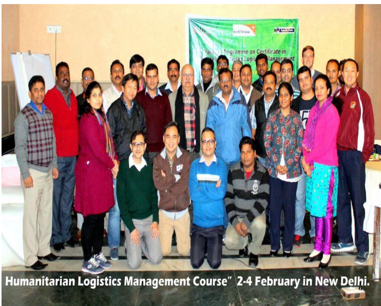
Humanitarian Logistics Management Course" 2-4 February in New Delhi.

Sphere India in coordination with The Kuehne Foundation's HELP Logistics AG and World Vision have organized the training programme for "Certificate in Applied Humanitarian Logistics Management" in humanitarian context on 02-04 February 2016 in Delhi, India.