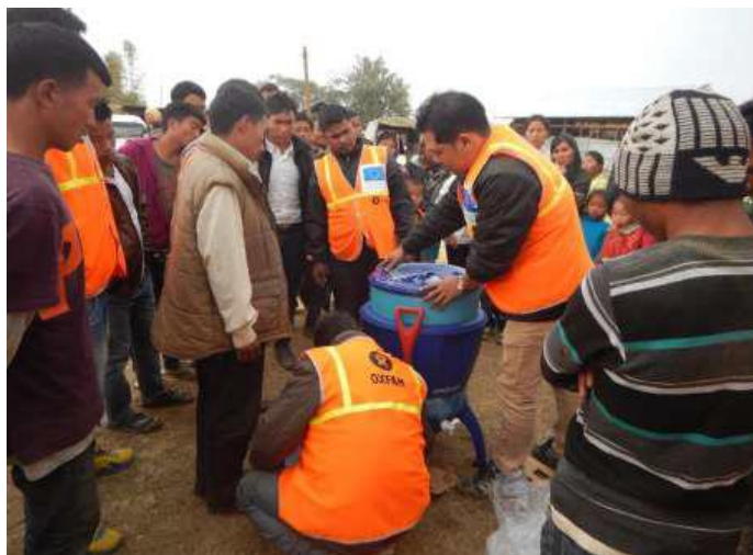
Photo : Demonstration of community water filter by OXFAM staff at Kabui Khullen 1 village (Tamenglong District)

With houses completely damaged or unsafe for use, and temperatures dropping up to 8 degrees at night, people were in urgent need of shelter Non-Food Items (NFIs) such as tarpaulins and blankets. OXFAM India, in partnership with Integrated Rural Management Association (IRMA), identified 300 earthquake affected households from 191 villages in Tamenglong, Senapati and Imphal (West) districts combined. Based on the findings of the rapid needs assessment, OXFAM India procured shelter (NFIs). OXFAM India started its earthquake response in Manipur on 30th January,