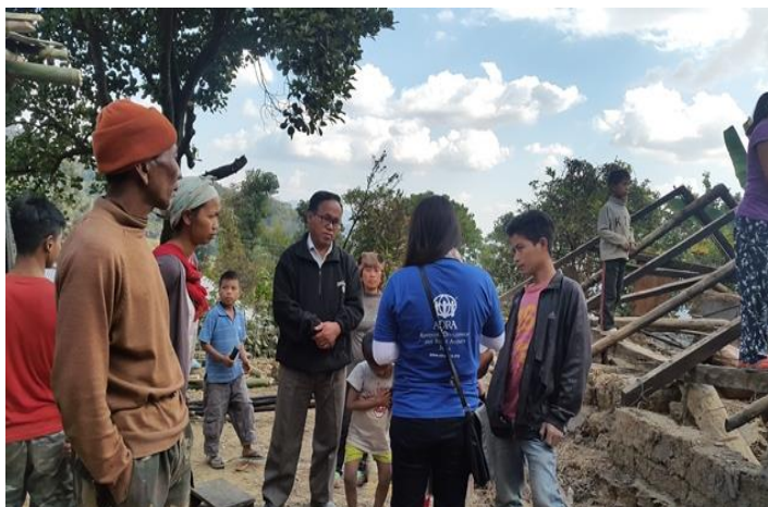
Interaction with Community during assessment

ADRA conducted joint assessment with Oxfam in Tamenglong, Senapati and Imphal West Districts visiting the affected areas and having focus group discussion and also one to one interview with the victims. Discussion has also been held with the Government departments during the assessment. The findings of the assessment led to response targeting 350 households for emergency shelter support (Tarpaulin and Groundsheet).