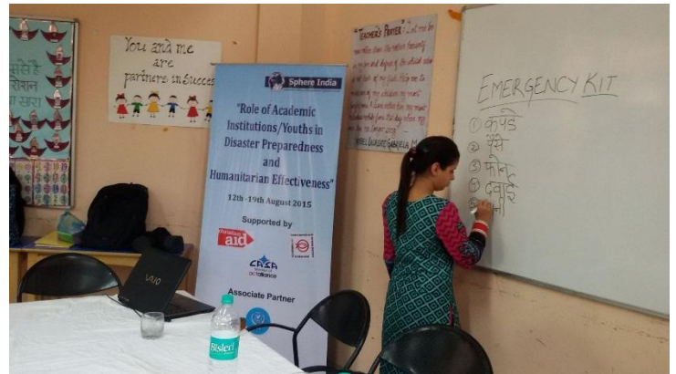
Group Discussion on Emergency Kit Items at Jamia University, New Delhi