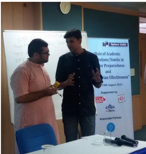
Group Work by AMITY Students on Localized Preparedness