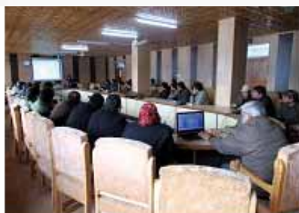
Poonch (3 rd February, 2015)