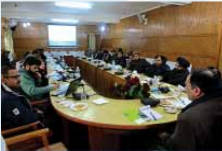
Shopian (29 th January, 2015)

The first multi-stakeholder district consultations were held at Shopian (29th January, 2015) Poonch (3rd February, 2015) and Kulgam (6th February, 2015) districts in J&K on preparation of Districts Disaster Management Plan (DDMP). As a follow up of these district consultations, departmental wise meetings with relevant officials was conducted for briefing on DDMP developmental process, share update about ongoing activities and seek their inputs. The HVCA field visits were carried out at these districts for the purpose of mapping of vulnerable areas.