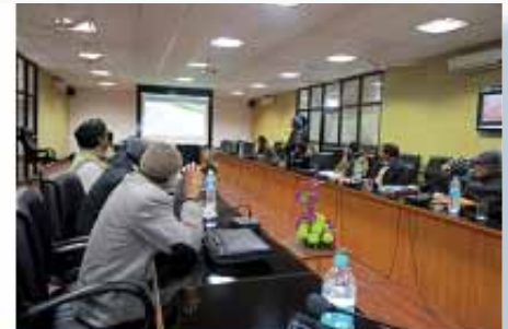
Kulgam (6 th February, 2015)

The final state consultation for finalizing the State DDMP was held on 4th February, 2015 at Gangtok, Sikkim.