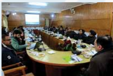
Shopian (29 th January, 2015)

The first multi-stakeholder district consultations were held at Shopian (29th January, 2015) Poonch (3rd February, 2015) and Kulgam (6th February, 2015) districts in J&K on preparation of Districts Disaster Management Plan (DDMP). As a follow up of these district consultations, departmental wise meetings with relevant officials was conducted for briefing on DDMP developmental process, share update about ongoing activities and seek their inputs. The HVCA field visits were carried out at these districts for the purpose of mapping of vulnerable areas.