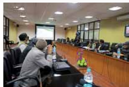
Kulgam (6 th February, 2015)

The final state consultation for finalizing the State DDMP was held on 4th February, 2015 at Gangtok, Sikkim.