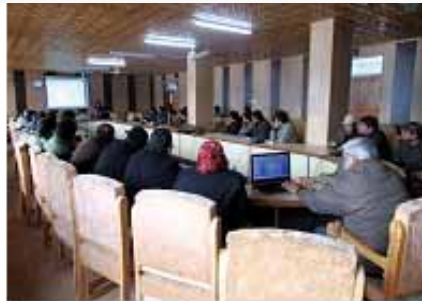
Poonch (3 rd February, 2015)