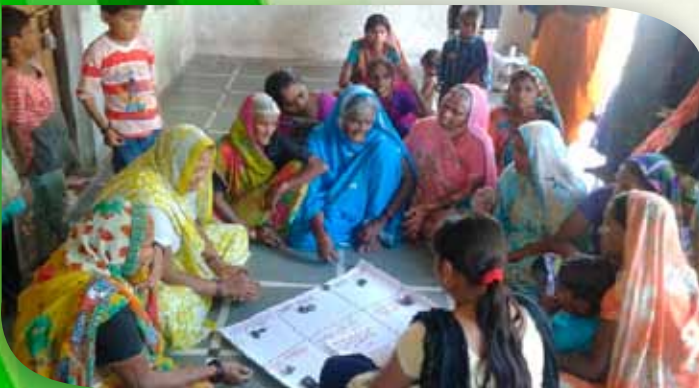
NCA INITIAL WORKSHOP: NUTRITION EXPERT AND COMMUNITY MEMBERS ARE DECIDING UPON HYPOTHESES.

In the month of November we organized Initial Stakeholder workshop for Nutrition Causal Analysis (NCA). In that IAG members were invited to participate. Participants experts from the field of nutrition, WASH and human rights and nutrition program were present in this workshop to provide their inputs on draft report of NCA. The objective of workshop was to develop hypotheses related to malnutrition in Jhirniya block of Khargone District of Madhya Pradesh. In month from November to December, 2014 the whole NCA survey was conducted in 4 villages of Jhirniya block of Madhya Pradesh. It took around 25 days to conduct the survey in the field area.