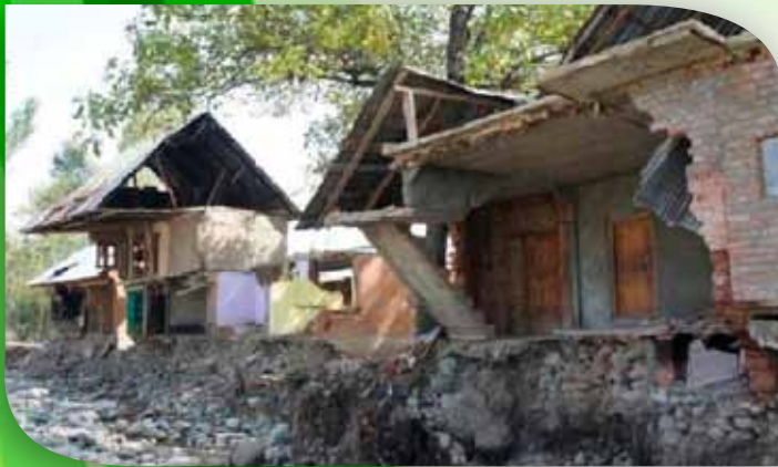
IN CONVERSATION WITH MUSRAT (IN BLACK SCARF) AND NUSRAT (IN WHITE SCARF) IN THEIR BROKEN HOME

started working as daily wage laborers in people's fields in order to meet the family's needs. As daily wage laborers, they earn about INR. 150 – 300 in a day, which is barely able to support the family. The floods worsened her situation as it swept away Musrat's family home and further aggravated their difficulties by leaving them homeless. The family presently lives in tents pitched on the banks of the river, and take shelter in their neighbors' homes when it becomes too cold.