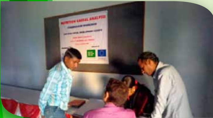
NCA INITIAL WORKSHOP: NUTRITION EXPERT AND COMMUNITY MEMBERS ARE DECIDING UPON HYPOTHESES.

IAG MP is mainly focusing on the food and nutrition security and its related work in the State of Madhya Pradesh. Recently IAG MP have done research on causes of malnutrition in Jhirniya block.