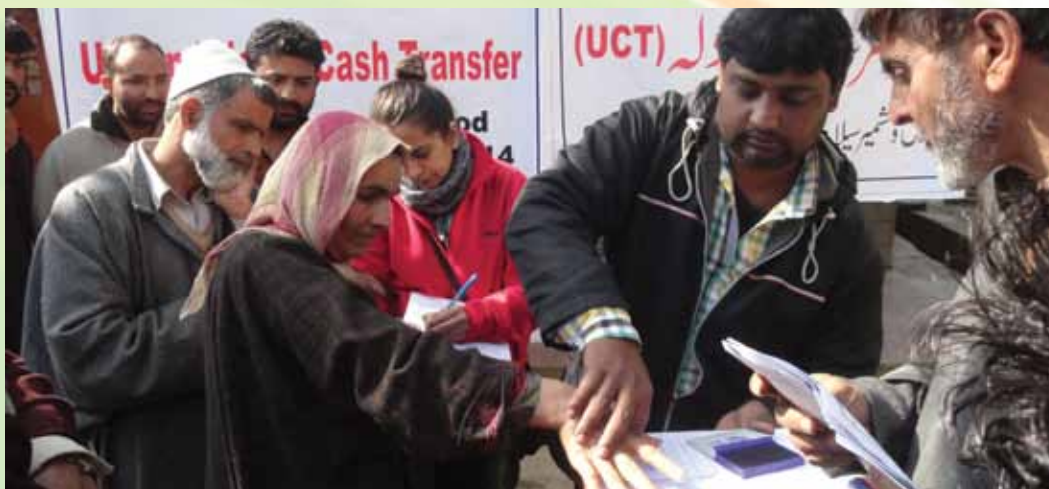
UNCONDITIONAL CASH TRANSFER UNDERWAY IN A VILLAGE IN KULGAM DISTRICT IN SOUTH KASHMIR

As of 19 Jan, reports state that 20 IDP camps exist with over 42,000 people who are yet to return back to their original villages. A large number of IDPs cannot return because their villages have been burnt, and given the insecurity in the area they fear that they will face violence again.