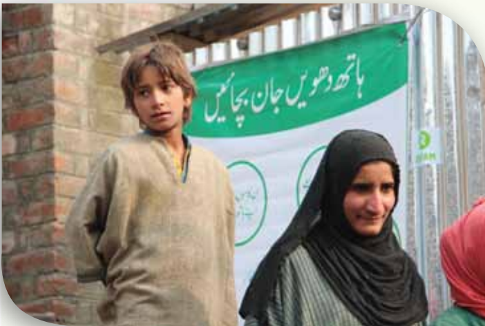
TOILETS CONSTRUCTED BY OXFAM IN LALHAR VILLAGE IN PULWAMA DISTRICT IN KASHMIR