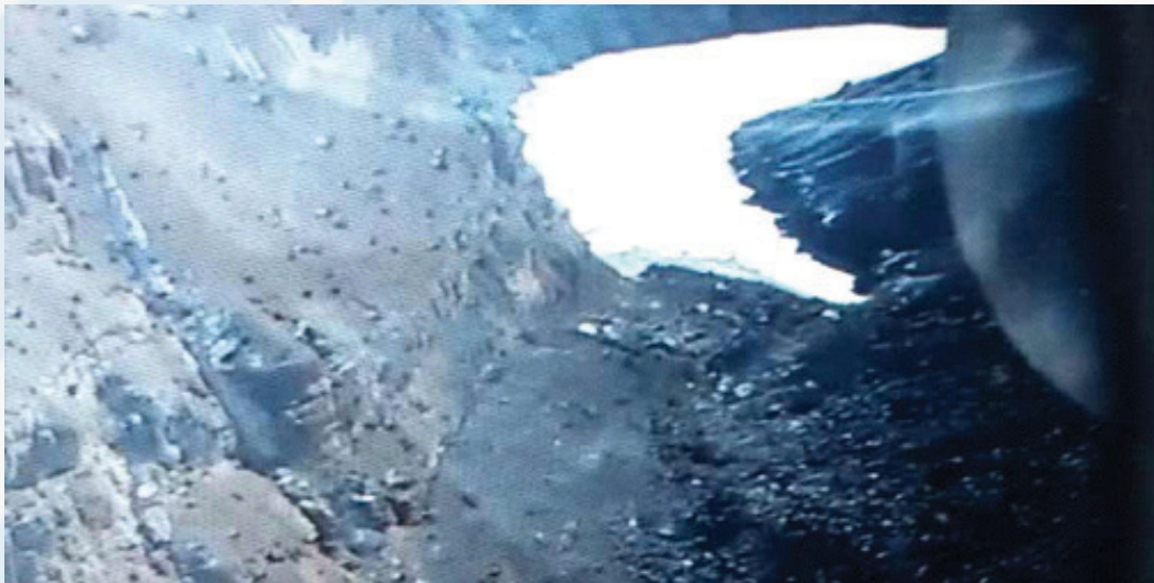
Fig: A massive reservoir of water created due to the blockade of river Phutkal caused by a landslide in the Zaskar region of J & K, India.

NDMA Team surveyed the artificial lake which is 50 metres high, 50 metres wide, and 500 metres long is rapidly expanding and threatening more than 4000 people in the low lying areas of Zaskar and parts of Leh as state administration has sounded an alert in the area