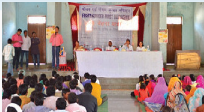
Fig: Yatra Opening Ceremony at Bhikangaon

Community meetings were organized in every village which were visited various issues were discussed like how to identify a SAM and MAM child, facilities in NRC, organic farming and importance and steps of Hand Washing. Different IEC Materials were distributed to spread more awareness.