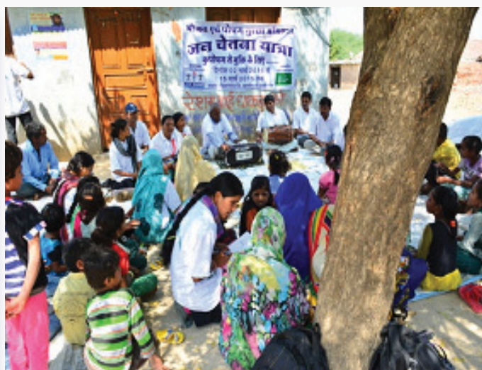
Fig: Village Level Meetings to discussion various issues related to malnutrition.