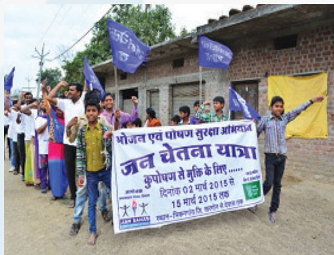
Fig: Jan Chetna Rally in village with children to spread the message on Malnutrition.