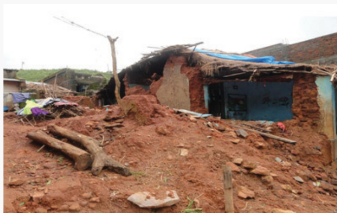
Fig: A photograph of a broken house in Gajapati district of Odisha during Cyclone Hudhud. CBM and its local partner Serango Christian hospital supported affected families by distributing immediate relief to 1471 affected families and followed this up by medical care camps

Emergency response and disaster risk reduction occupy an important part in CBM programming in India. During the period 2015-2019, CBM will train partners in inclusive disaster risk reduction, formulate village contingency plans and mainstream the issue of disability in disaster response to ensure that the organizational responses are inclusive to people with disabilities.