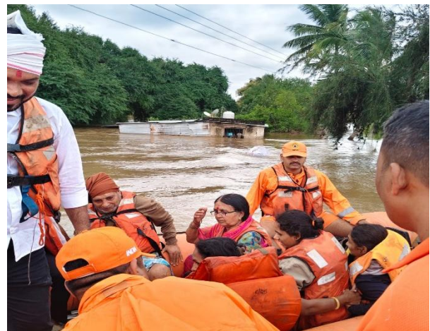
Flood Rescue Operations by ARMY and NDRF in flood hit areas