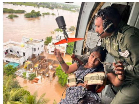
Flood Rescue Operations by Airforce in flood hit areas