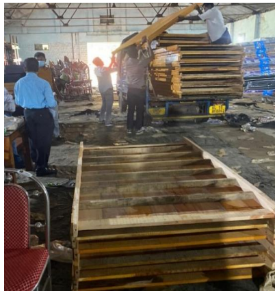
Furniture Provided by Legal Service Authority