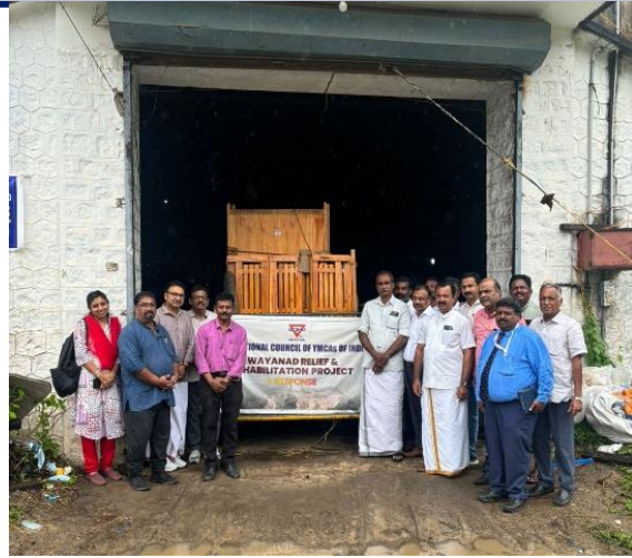
Furniture Provided By YMCA, India