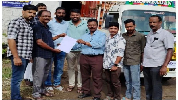
Yuvareshmi Library Hand Over Furniture To Deputy Collector