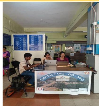
GO- NGO Coordination Desk, SEOC

On 23rd August, a high-level meeting was convened by the district authority, involving the Chief Secretary and affected individuals from Mundakkai & Chooralmala. The discussion centred on ongoing rehabilitation efforts and long-term support strategies for the affected communities, with active participation from the victims.