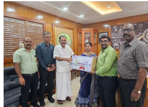
YMCA Ernakulam: Delivered Essential Medicines To Collector And Hon'ble Wild Life Minister