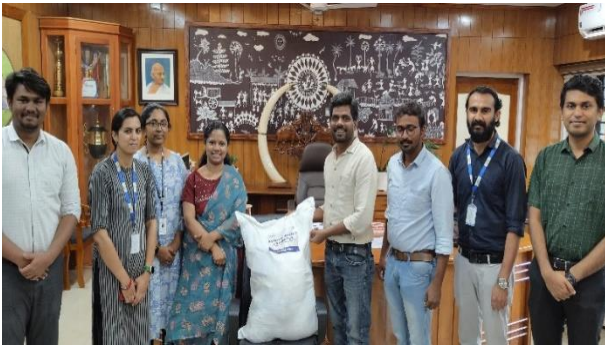
Nirmaan handover the essential kit to collector