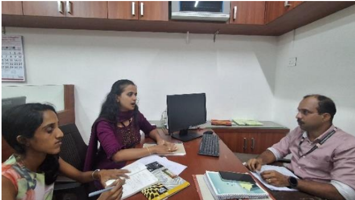
Meeting In District Social Justice Department

A meeting with the junior supernatant District Social Justice Department focused on addressing the challenges faced by vulnerable communities, including differently-abled individuals, transgender persons, and the elderly, in the aftermath of the landslide, and identifying gaps where the Go-NGO coordination desk can enhance support and collaboration for their sustainable recovery.