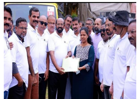
FUMMA Members Delivered Essential Furniture to the District Collector