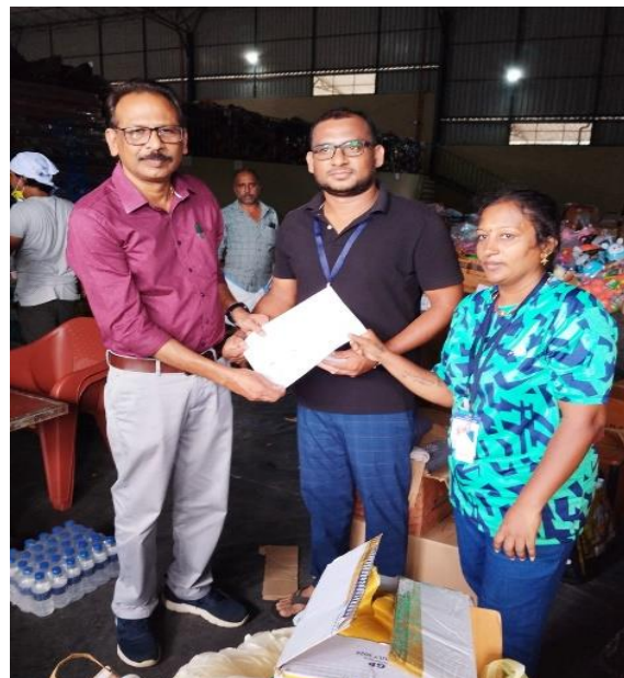
Smart Modern School Hand Over Essential Items To Deputy Collector