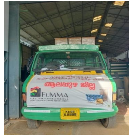
The Delivery Vehicle Of FUMMA

>>Check out our previous bulletin for more information: News Bulletin Wayanad Landslide edition1