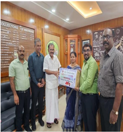
YMCA Ernakulam: Delivered Essential Medicines To Collector And Hon'ble Wildlife Minister