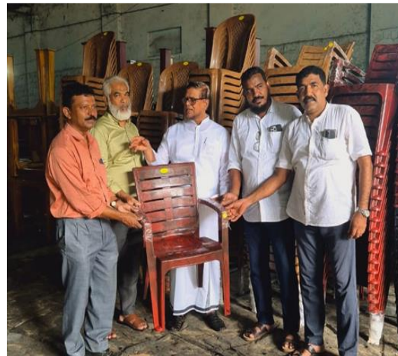
Delivery Of Fibre Chair By Global School, Kozhikode