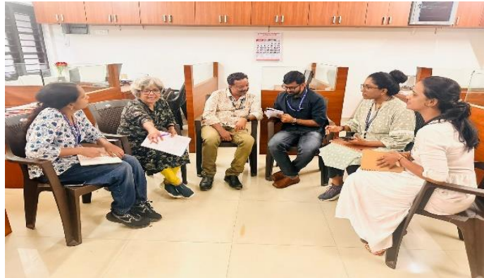
Meeting With the Social Inclusion Team Of PDNA