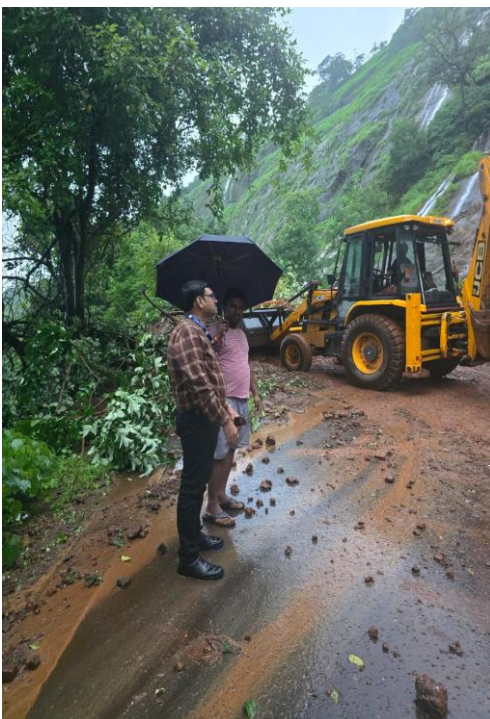
Landslide in Tamhini ghat