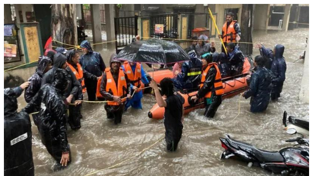
Flood situation in different districts of Maharashtra