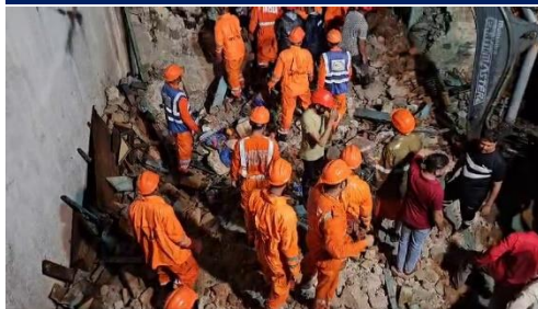
NDRF Rescue operations after a house collapsed of Dwarka district