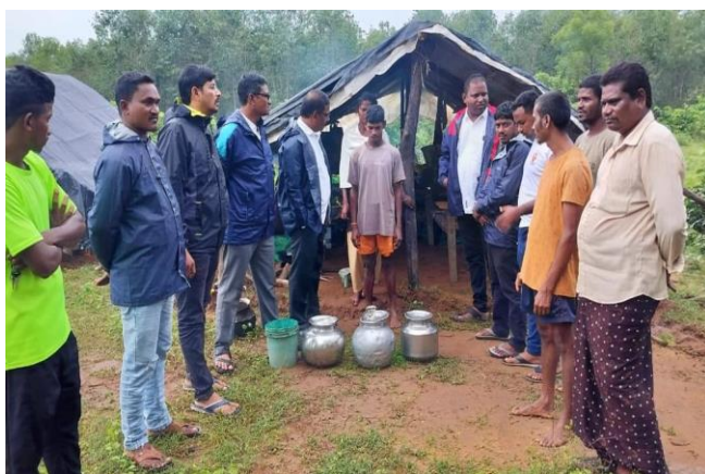
Villagers erecting makeshift tents in the Agency area as floodwaters entered their habitations, in Eluru district