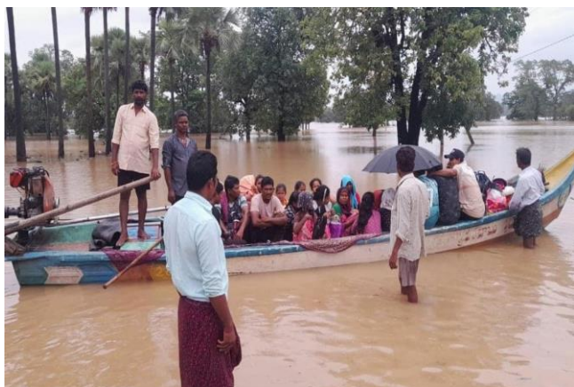
Tribal villagers being evacuated on a boat as the Sabari backwaters entered the outskirts of Chintoor headquarters in ASR district